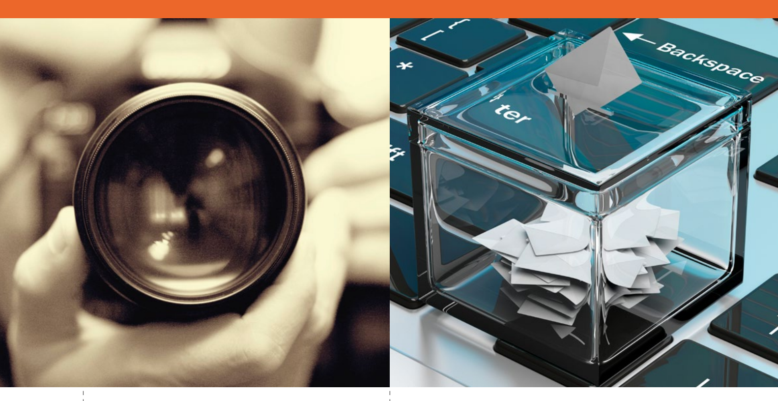
Council of Europe study DGI(2017)11

Study on the use of internet in electoral campaigns