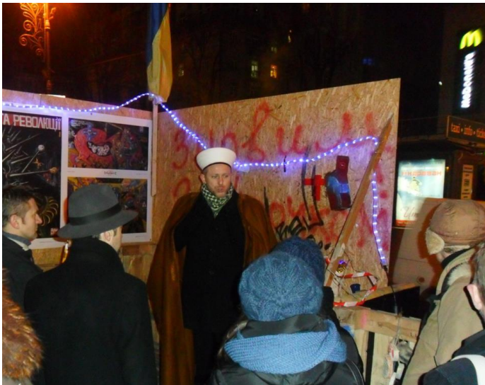
Photo 4. Muslim religious presence at the Maidan. 81

The earlier 2004 Orange Revolution tradition of common statements by Orthodox, Catholic, and Protestant leaders was again restored. Normally, they were issued by the All-Ukrainian Council of Churches and Religious Organizations that embraced all the sociologically significant religious jurisdictions including the UOC-MP. Filaret (Denysenko), Patriarch of Kyiv and all-Rus of the UOC-KP, and Sviatoslav (Shevchuk), Patriarch (Major Archbishop) of Kyiv and Halych of the UGCC, were especially eloquent in defending the civic rights of the protesters.