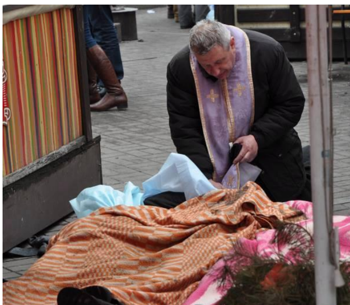
Photo 5. First prayers near the recently killed protesters. 85