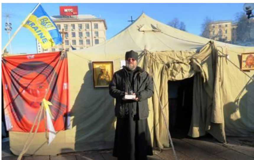
Photo 3. The prayer tent at the Maidan. 80

From that time on, the people of Maidan opened their hearts to representatives of different Churches and religious groups. It became a place of special ecumenical and inter-religious cooperation. Many priests and pastors served as Maidan chaplains, especially during the nights. There was one prayer tent built by the Ukrainian Greek Catholic Church (UGCC) and used as an ecumenical chapel for all different confessions (see photo 3 ).