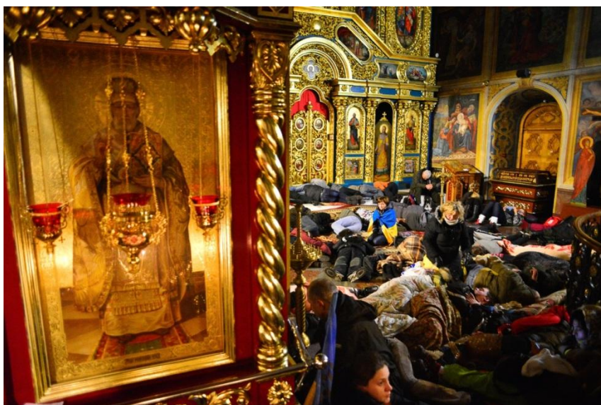
Photo 2. Hunted and wounded people at Saint Michael's monastery in Kyiv. 79

From that time on, the people of Maidan opened their hearts to representatives of different Churches and religious groups. It became a place of special ecumenical and inter-religious cooperation. Many priests and pastors served as Maidan chaplains, especially during the nights. There was one prayer tent built by the Ukrainian Greek Catholic Church (UGCC) and used as an ecumenical chapel for all different confessions (see photo 3 ).